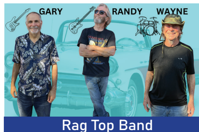
Rag Top Band